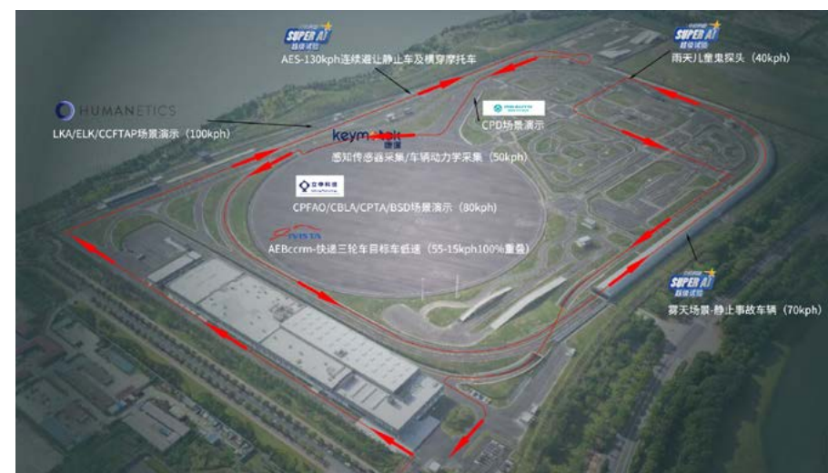
Suzhou Yangcheng Lake Island Intelligent Connectivity Test Site